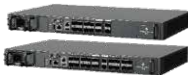
TCX08/TCX16 COMBO PON OLT

As the industry's largest stocking provider of wireless communications equipment, Winncom also needs to adapt. As your partner, our mission, through our value-added services and engineering support, is to assist you with the development, implementation, and management of your next-generation network infrastructure. Through active equipment like Nokia's or DZS's GPON, XGS PON, or 25GS-PON, or passive outside or inside plant Fiber and accessories, Winncom is committed in stocking and distributing world-class products and services that will give you your network of tomorrow today!