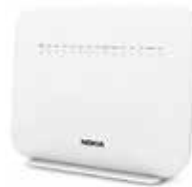
XGS PON Residential Gateway