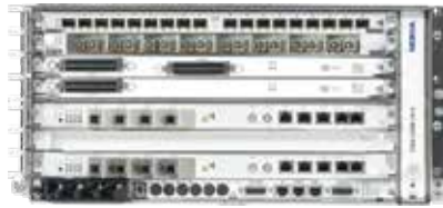
Nokia FX-4 Starter Kit